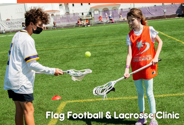
Flag Football & Lacrosse Clinic