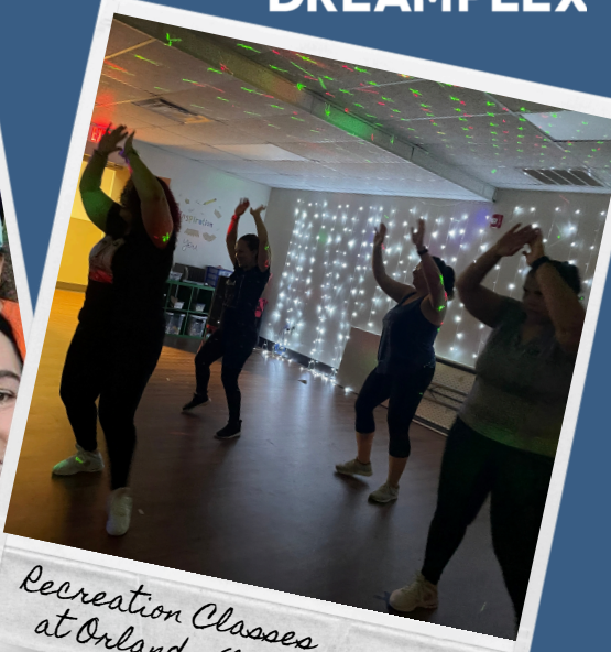
Recreation Classes at Orlando (Zumba)