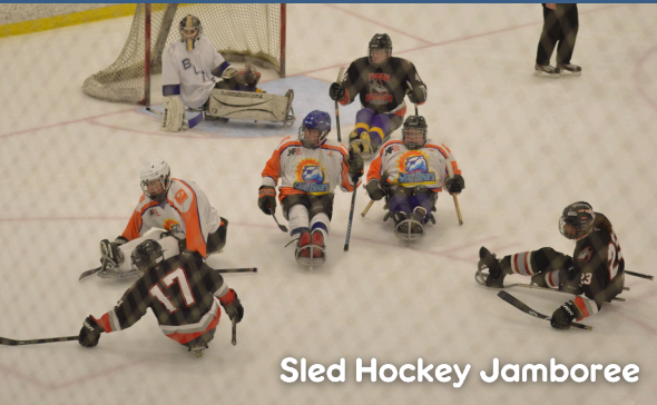
Sled Hockey Jamboree