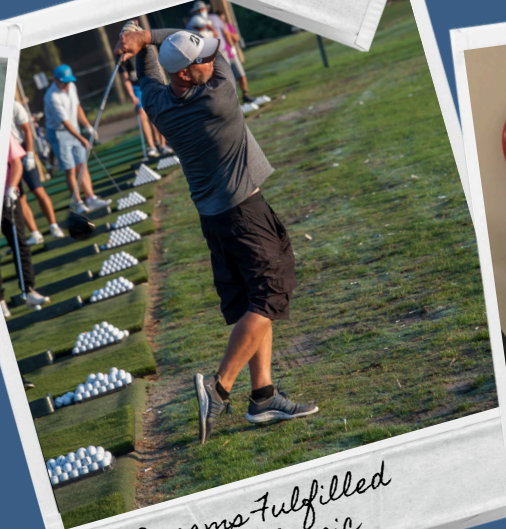
Dreams Fulfilled Golf Classic