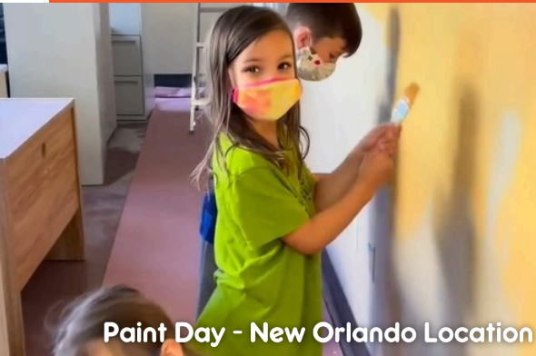
Paint Day - New Orlando Location