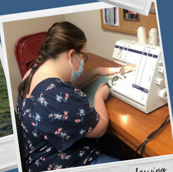
Vocational Program - Sewing