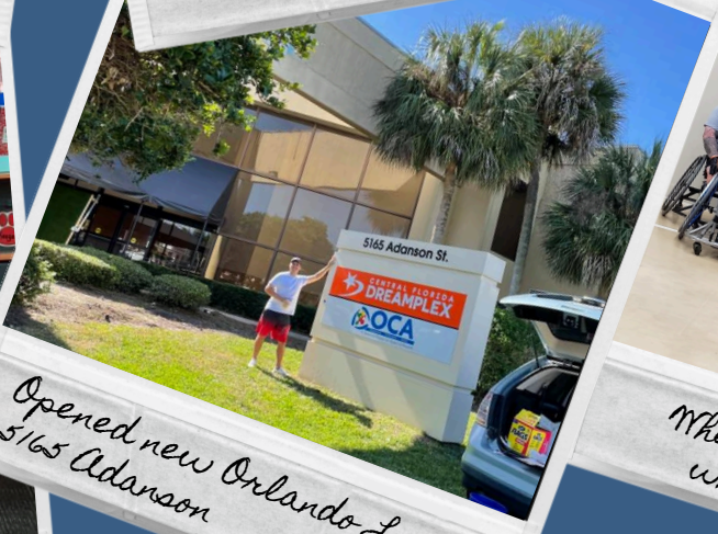
Opened new Orlando Location 5165 Adanson