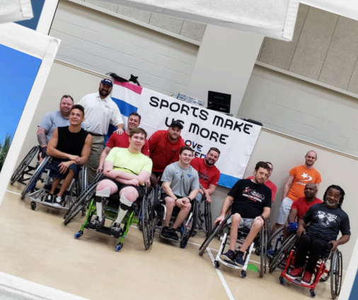
Wheelchair Football w/ Move United