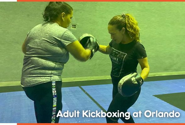
Adult Kickboxing at Orlando