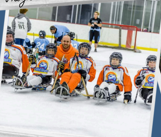
Sled Hockey Jamboree