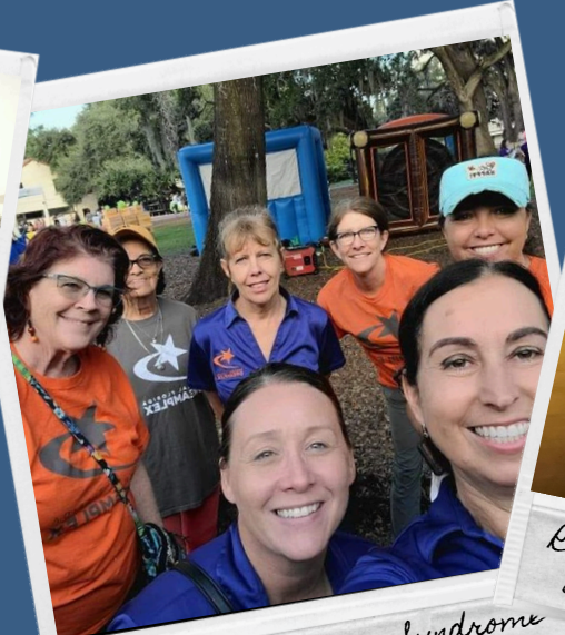
Step Up for Down Syndrome Buddy Walk