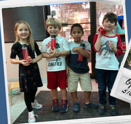
Listening & Spoken Language Program