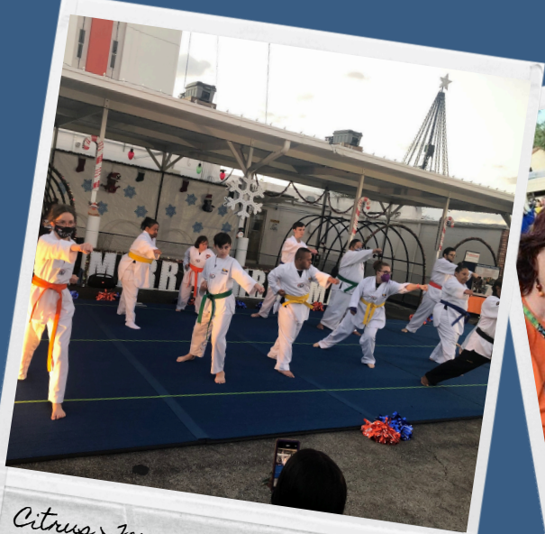
Citrus Tower Christmas Spectacular